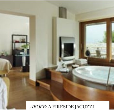
ABOVE: A FIRESIDE JACUZZI IN AN EXECUTIVE VILLA. BELOW: AN AMBASSADOR VILLA BEDROOM WITH BATH

Enjoy a view beyond compare at Nafplia Palace Hotel & Villas, set in an ancient Greek fortress