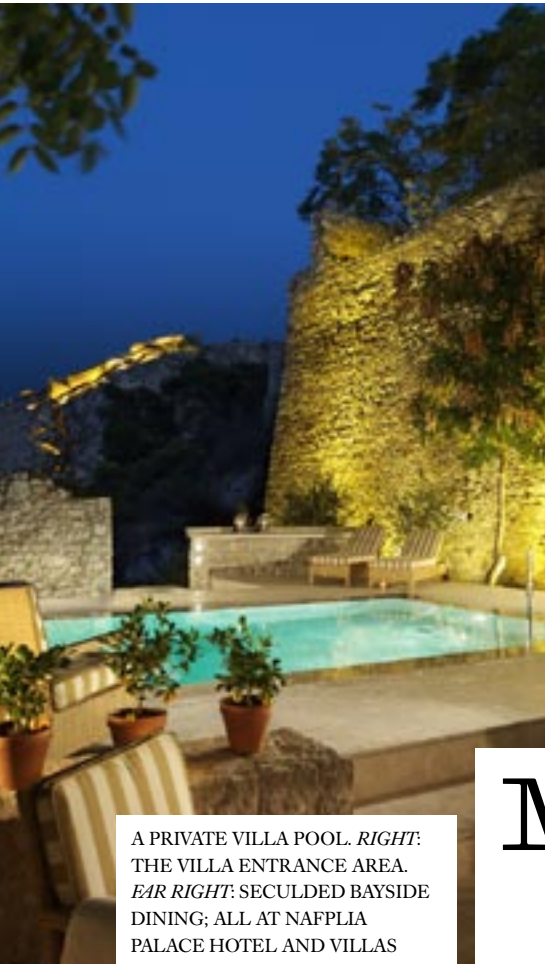
A PRIVATE VILLA POOL. RIGHT: THE VILLA ENTRANCE AREA. EAR RIGHT: SECULDED BAYSIDE DINING; ALL AT NAFPLIA PALACE HOTEL AND VILLAS